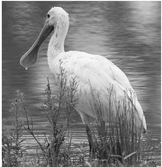
Roseate Spoonbill, 31 May 2017, Baldwin Co., AL