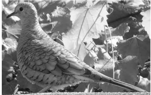
Inca Dove, 18 April 2017, Baldwin Co., AL