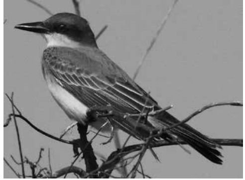
Gray Kingbird, 21 March 2017, Baldwin Co., AL