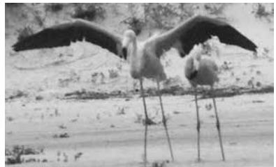
American Flamingo, 22 June 2017, Baldwin Co., AL