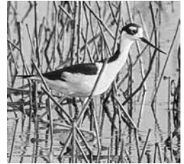
Black-necked Stilt, 31 May 2017, Barbour Co., AL