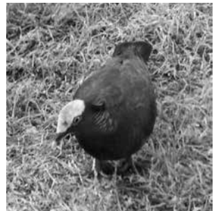
White-crowned Pigeon, 29 April 2017, Mobile Co., AL; C.D. Hicks.

WHITE-WINGED DOVE – Tom Siegwald counted 29 at Mobile, Mobile , 12 April (spring