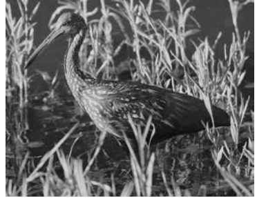
Limpkin, 15 May 2017, Talliposa Co., AL