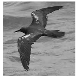
Brown Noddy, 23 June 2017, Baldwin Co., AL