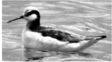
Wilson's Phalarope, 5 May 2017, Lauderdale Co., AL