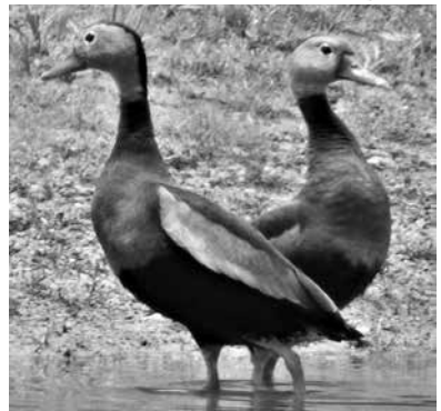
Black-bellied Whistling-Duck, 9 June 2017, Barbour Co., AL; R.J. Kittinger.