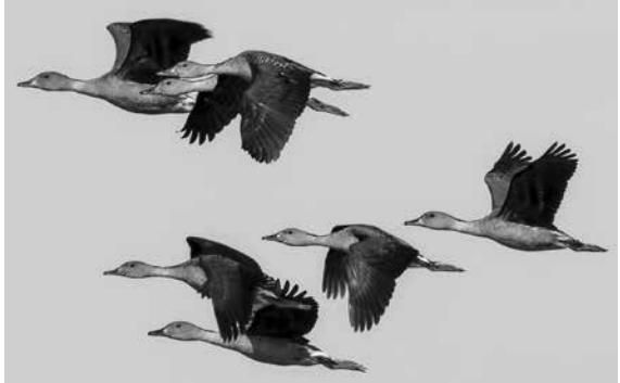
Fulvous Whistling-Duck, mid-May 2017, Mobile Co., AL; M. Walter.

FULVOUS WHISTLING-DUCK – Now only casual in Alabama, 10 were on the east end of Dauphin Island, Mobile , early-mid May (Mac Walter; ph.) (third record since 2000; @ABRC).