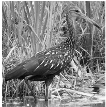
Limpkin, 17 May 2017, Covington Co., AL