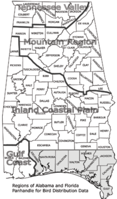
Regions of Alabama and Florida Panhandle for Bird Distribution Data

This report covers the period from March through May 2017 in Alabama and the Florida Panhandle (west of the Apalachicola River). The appearance of observations in this article does not suggest verification or acceptance of records for very rare species; these must be considered by the appropriate state records committees. All submissions of birds that are rare, either in general or for a particular season or region, must be accompanied by adequate details of the observation. The extent of this documentation depends on the rarity of the species and the difficulty of identification. For guidance, observers are encouraged to consult the Alabama Ornithological Society checklist. Reports should note conditions of observation and the diagnostic characters observed. Your help in this matter is appreciated.