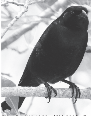
Shiny Cowbird, 11 May 2014, Mobile Co., AL