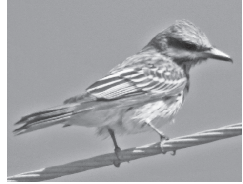
Sulphur-bellied Flycatcher, 19 May 2014, Baldwin Co., AL

WESTERN KINGBIRD – Rare in spring along the Gulf Coast, two sightings