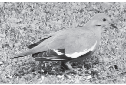
White-winged Dove, 31 May 2014, Lauderdale Co., AL