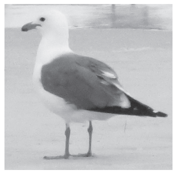
California Gull, 16 March 2014, Escambia Co., AL; L. Duncan.