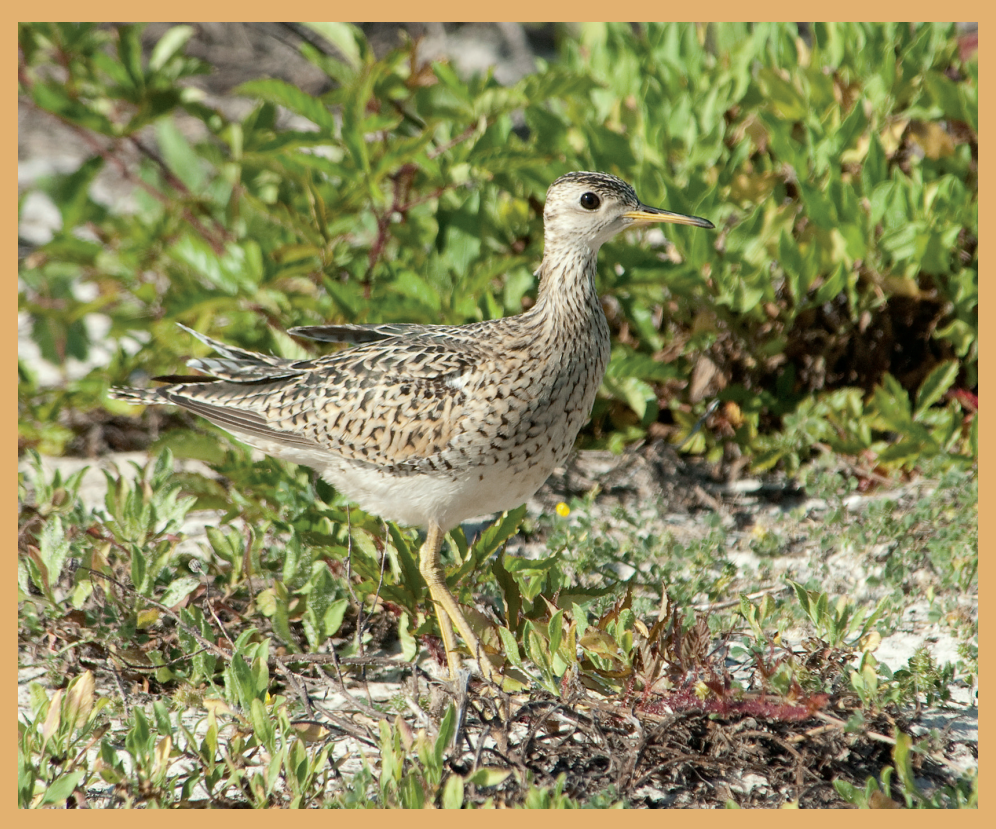
Journal of the Alabama Ornithological Society