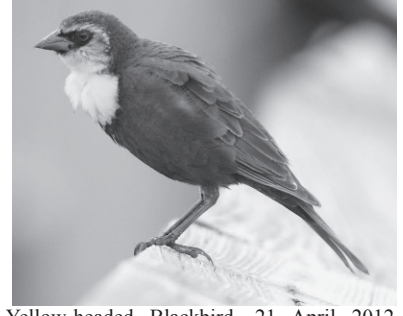
Yellow-headed Blackbird, 21 April 2012, Mobile Co.; B. Chennupati.

BALTIMORE ORIOLE – Four early birds were on Dauphin Island, Mobile , 7 April (Howard Horne, Patsy Russo, Zach Loman).