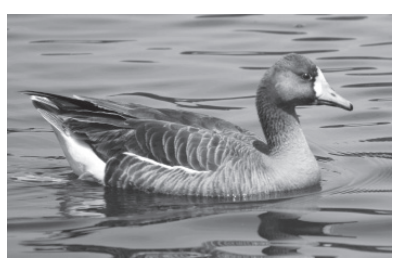
Greater White-fronted Goose, 1 May 2012, Jefferson Co., AL