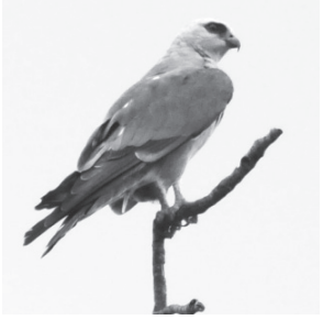
Mississippi Kite, 5 August 2012, Jefferson Co., AL