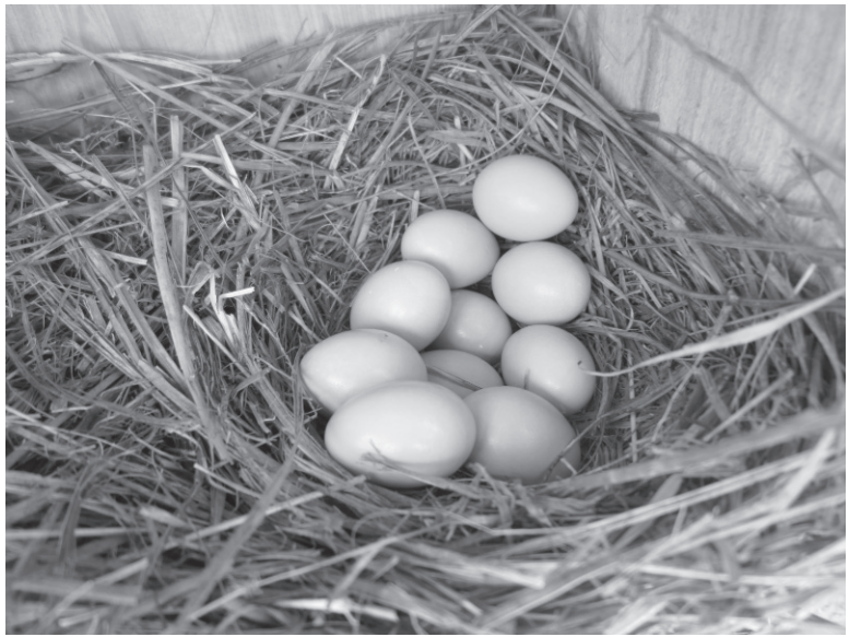
Figure 1. Eastern Bluebird nest containing ten eggs on the Wehle Forever Wild Tract, Bullock County, Alabama. Photograph by John Trent on 1 April 2012.

Another unusual aspect of this observation was the increased level of