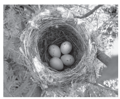
Figure 3. Contents of Willow Flycatcher nest in Hale Co., Alabama. Photograph by B. Summerour on 15 June 2010.

process, allowing us to calculate when the first egg was laid. Willow Flycatchers typically have clutch sizes of three–four eggs, occasionally five (Sedgwick 2000). Eggs are laid one per day, with one day often skipped during the process (Sedgwick 2000). Based on our findings from 14 and 15 June when the nest had three and four eggs, respectively, the first egg was laid approximately on 11 June.