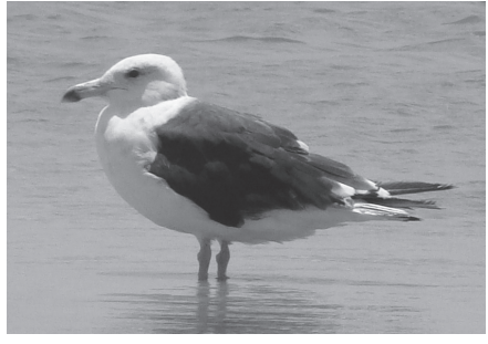
Great Black-backed Gull, 21 July 2010, Mobile Co., AL; Lisa Hug.