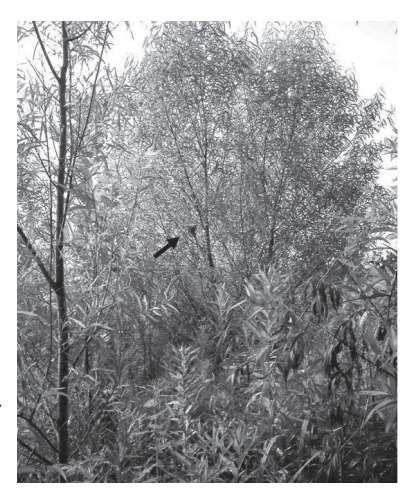
Figure 2. Nest of Willow Flycatcher in Hale Co., Alabama. Nest located in Black Willow at center (arrow). Photograph by B. Summerour on 14 June 2010.

On 8 July, we revisited the second nest only to find it empty. There was no sign of disturbance to the nest. Both birds were present and emitting the "whit" call regularly; singing by the male had completely tapered off. A final visit was made on 23 July and no individuals