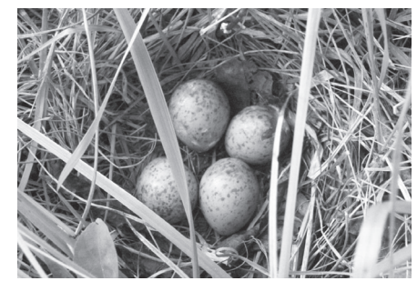
American Woodcock, 1 June 2010, Lauderdale Co., AL; D. Simbeck.