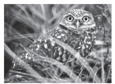
Burrowing Owl, 12 December 2009, Mobile Co., AL; D.W. Dortch.