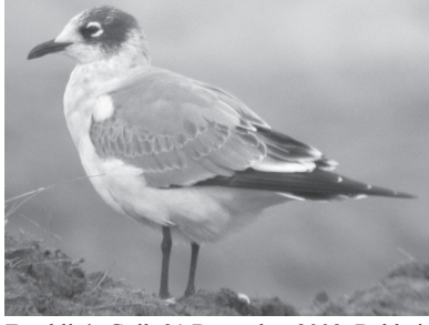
Franklin's Gull, 31 December 2009, Baldwin Co., AL