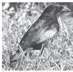
Bronzed Cowbird, 3 November 2009, Baldwin Co., AL; B. Summerour.