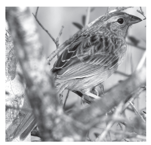
Figure 1. Bachman's Sparrow, Splinter Hill Bog, Baldwin Co., Alabama, 19 February 2008, E. Soehren.

the sparrow quickly flew from the burrow and flitted back to the same oak where we first photographed it. We repeated our approach, and without hesitation, the bird once again flew straight back to the tortoise burrow where it remained for another