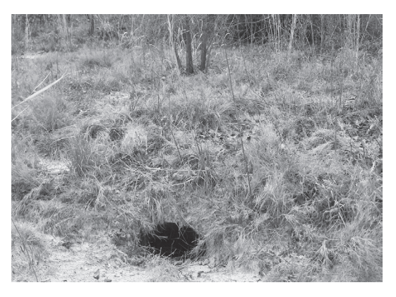
Figure 2. Active gopher tortoise burrow used by retreating Bachman's Sparrow, Splinter Hill Bog, Baldwin Co., Alabama, 19 February 2008, E. Soehren.

a nearby burrow. The advantage of this escape tactic likely discourages the most diligent of pursuers, but upon entering the subterranean realm of a dark burrow. Bachman's Sparrows may incur other unforeseen threats. Among the most apparent is the potential of encountering a predator within a burrow passage, particularly one of several species of predatory snakes [e.g. Indigo (Drymarchon couperi), Snake Eastern Coachwhip (Masticophis f. flagellum), Pinesnake (Pituophis melanoleucus ssp.), Cottonmouth