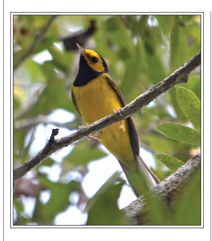
A Hooded Warbler in the Shell Mounds, one of 21 warbler species reported at the AOS spring meeting. (Bob Reed)

right! Scarlet Tanagers were seemingly everywhere! Summer Tanagers also were quite abundant and the Indigo Buntings and Blue Grosbeaks were bountiful at the Shell Mounds Park where seed had been scattered to attract them. Patient birders were rewarded by sightings of male Painted Buntings—such colorful birds and so worth the wait to see them! Bob and Lucy Duncan remarked to Greg when they crossed paths at the Shell Mounds that the conditions we were experiencing felt like the "good old days!" when birds were readily seen in multiple island locations and one had to dart from site to site to track down all the reports!