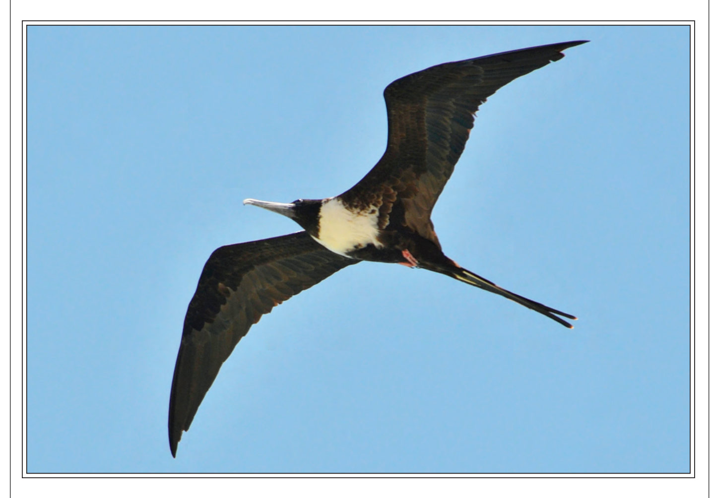
Opposite page: Begun in 1846, Fort Jefferson is the largest masonary structure in the Western Hemisphere. Above: A female Magnificent Frigatebird.

There were nine species of warblers, including Cape May, American Redstarts, Hooded and Black-throated Blues. Cattle Egrets allowed for close approach, and Cliff, Bank, Barn and Northern Rough-winged Swallows hawked throughout the fort.